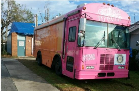
Parker Bookmobile on loan from the Rotary Club of Chesterland, Ohio