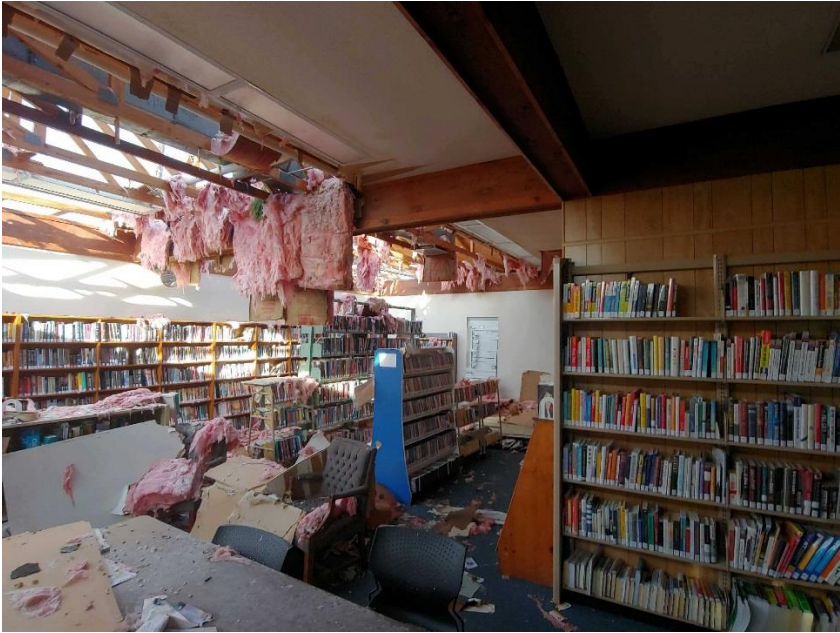
Interior of the Parker Public Library after Hurricane Michael (October 10, 2018)

Hurricane Michael hit the Bay County area on October 10, 2018. The Parker Public Library had the most damage from the hurricane and lost a large portion of its roof causing 4,000 books and other materials to be destroyed. While the library was being repaired, a bookmobile was loaned by the Rotary Club of Chesterland Ohio to be able to provided library services to the Parker Community.