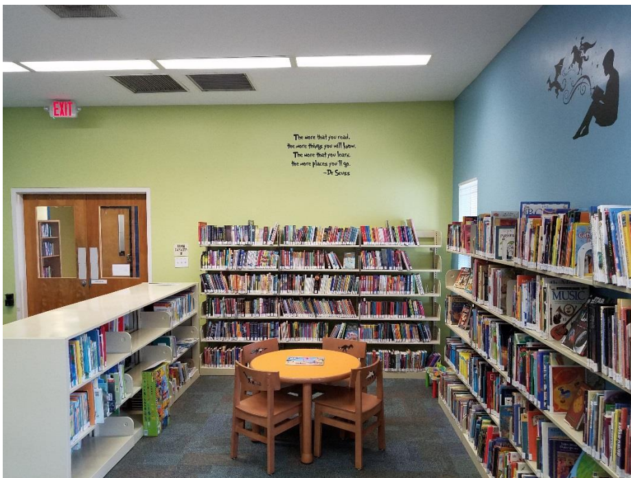
Renovated Parker Public Library after the Hurricane Michael repairs.