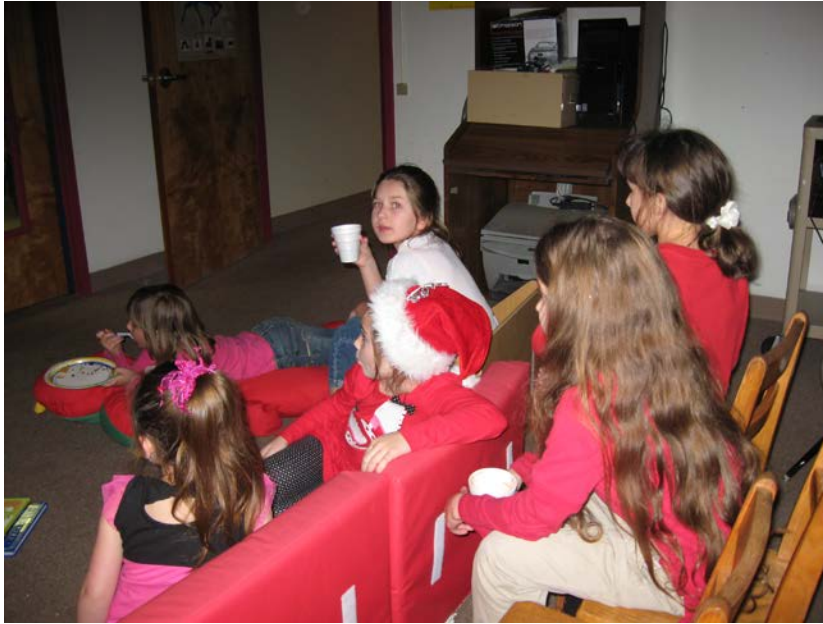
Some Liberty County children enjoy hot chocolate and popcorn during a screening of The Polar Express at the Harrell Memorial Public Library in Bristol

Liberty County children enjoyed a showing of the film The Polar Express at the Harrell Memorial Public Library on December 15 th . Refreshments were provided courtesy of the Friends of the Liberty County Libraries.