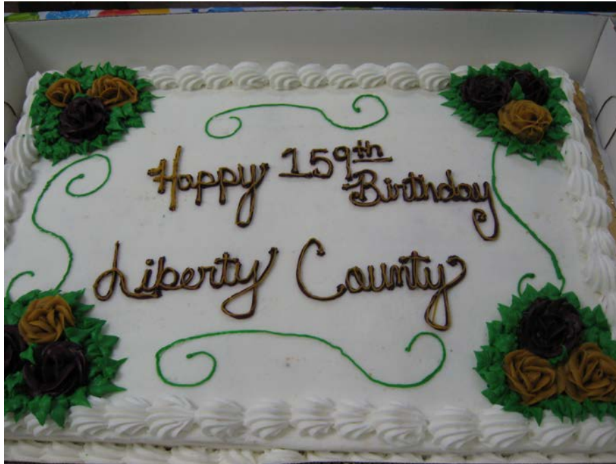
One of the birthday cakes decorated with Liberty County High School colors celebrating the 159 th anniversary of the founding of Liberty County.

On December 15 th , the Liberty County libraries celebrated Liberty County's 159 th birthday with free cake and refreshments provided courtesy of the Friends of the Liberty County Libraries.