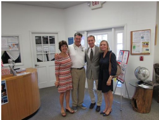
The Warriners and the Hamms